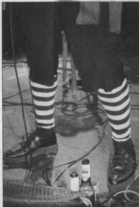
A band member wears appropriate attire, right down to his toes.